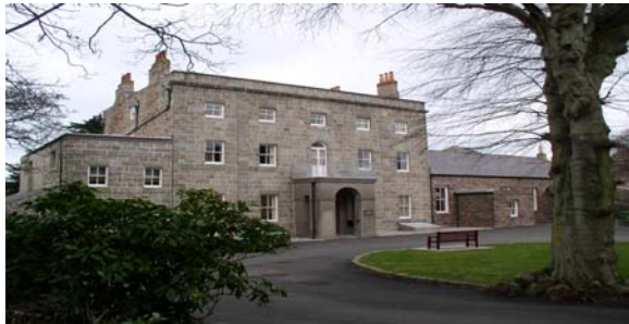
The Town Walk includes a visit to the Anne French Room within the restored Island Hall in Connaught Square.