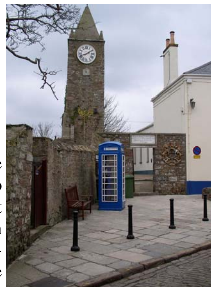
Improving the townscape, re-laid flagstones and bollards outside the Museum.